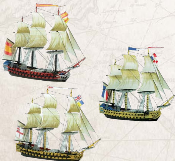
Third Rate Squadron SKU: 792010002 £30.00 / $48.00