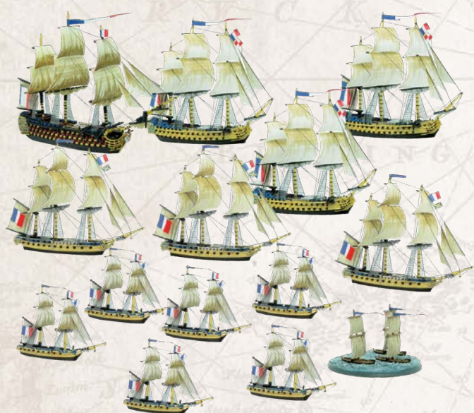
French Navy Fleet SKU: 792012001 £75.00 / $120.00