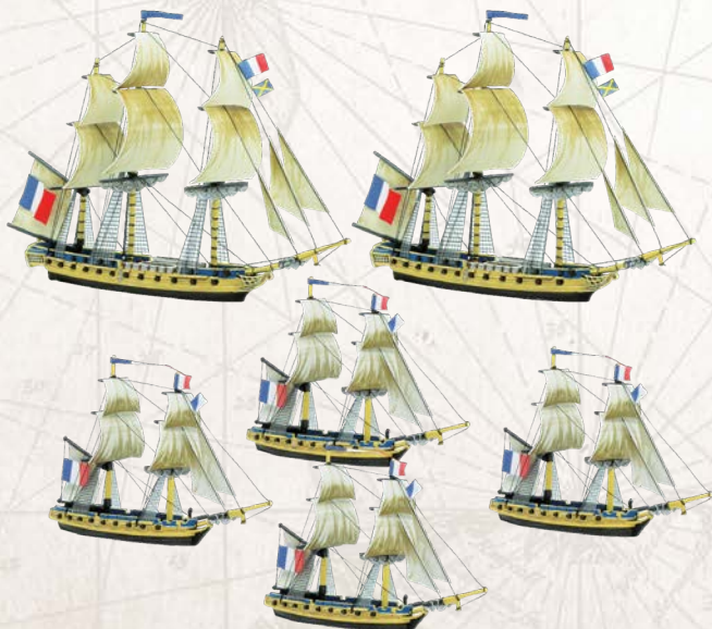
Frigates & Brigs Flotilla SKU: 792010001 £20.00 / $32.00