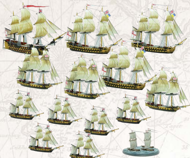
Royal Navy Fleet SKU: 792011001 £75.00 / $120.00