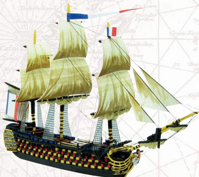
French Navy First Rate SKU: 795101001 £22.00 / $35.00