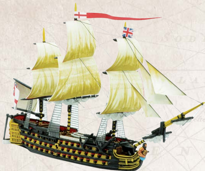
Royal Navy First Rate SKU: 795101001 £22.00 / $35.00